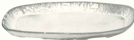
7QS-13" STEAK PLATTER (SHALLOW PLATTER)—3.00