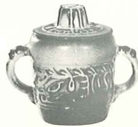
7B-SUGAR WITH LID—2.50