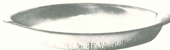
7Q-13" DEEP PLATTER—5.00