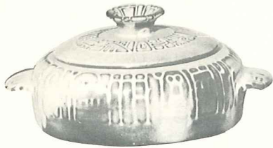
7V-2 QT. BAKER/BEAN POT—5.50