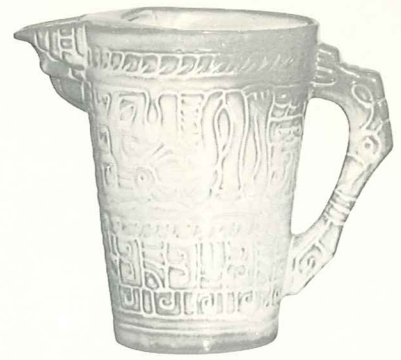
*7D-2 QT. PITCHER—5.00