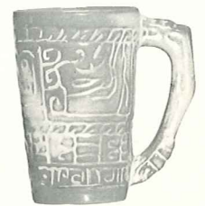
*7M-14 OZ. MUG—2.50