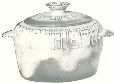
7W-3 QT. BAKER/BEAN POT—7.00