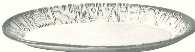
7TP-17" AZTEC OVAL PLATTER—10.00