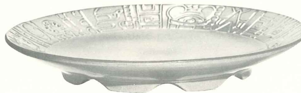
7FC-15" CHOP PLATE—12.50