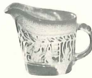
7A-6 OZ. CREAMER—2.00