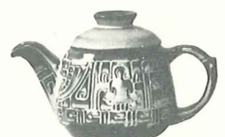
*7J-2 CUP TEAPOT—3.50

THIS PAGE AVAILABLE IN PRAIRIE GREEN, DESERT GOLD, WHITE SAND AND WOODLAND MOSS.