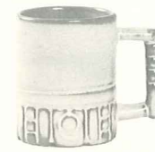
*C-4-12 OZ. COFFEE MUG—2.00