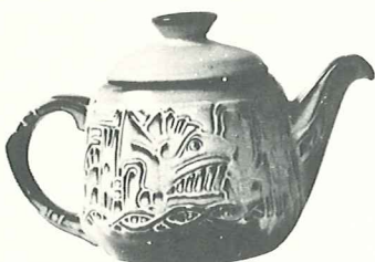
*7T-6 CUP TEAPOT—5.00